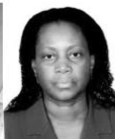
Celia Erna Cumbe Councillor for Finances, City of Maputo, Mozambique