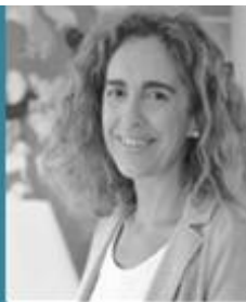
Ibone Bengoetxea Deputy Mayor, Bilbao City Council

The challenge of good governance in local administrations