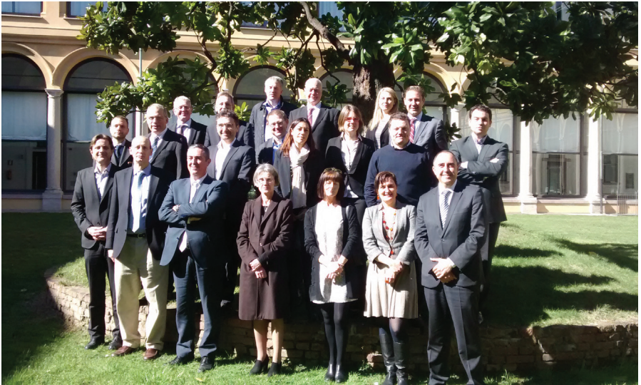
Third meeting European City Economic & Financial Governance (CEFG) Group, Milan, 6 March 2015